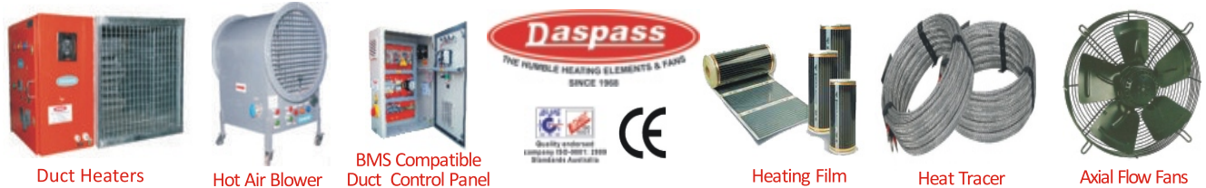
Duct Heaters Hot Air Blower BMS Compatible Duct Control Panel Daspas THE HUMBLE HEATING ELEMENTS & FANS SINCE 1968 Heating Film Heat Tracer Axial Flow Fans